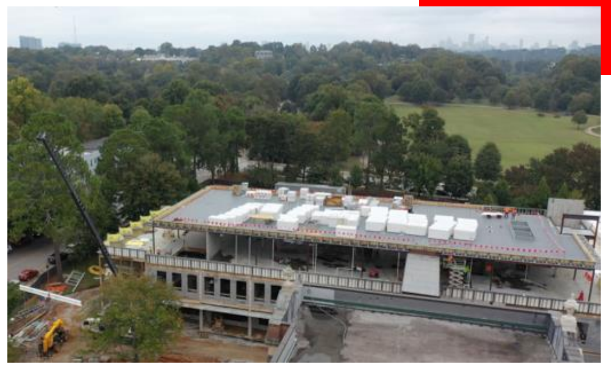
New Addition Progress