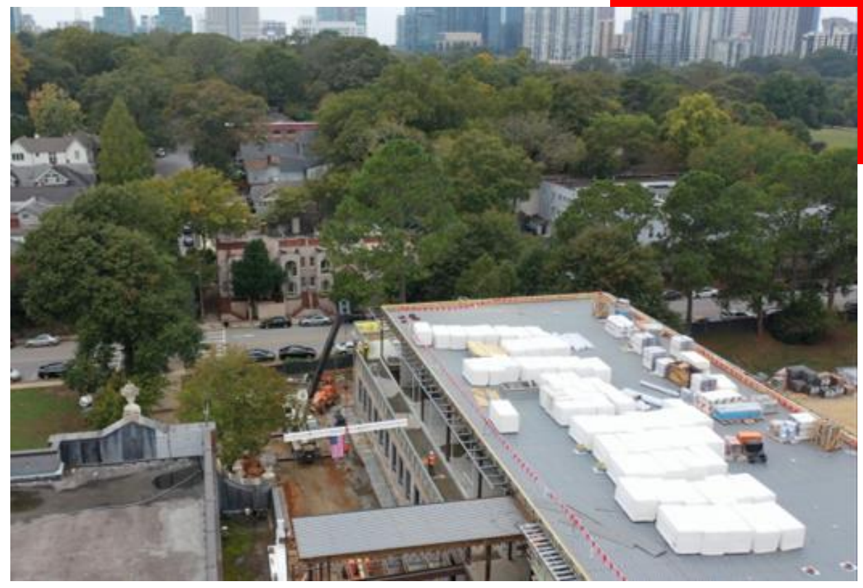
Final Topping Out Beam Being Set at New Addition Bridge