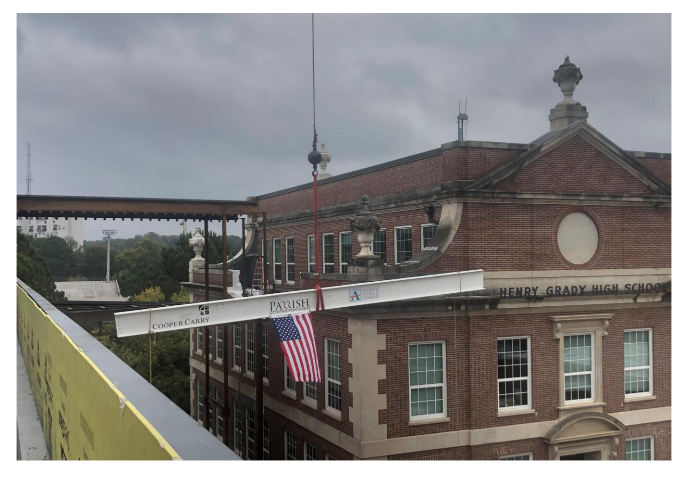
Topping Out Beam Being Placed