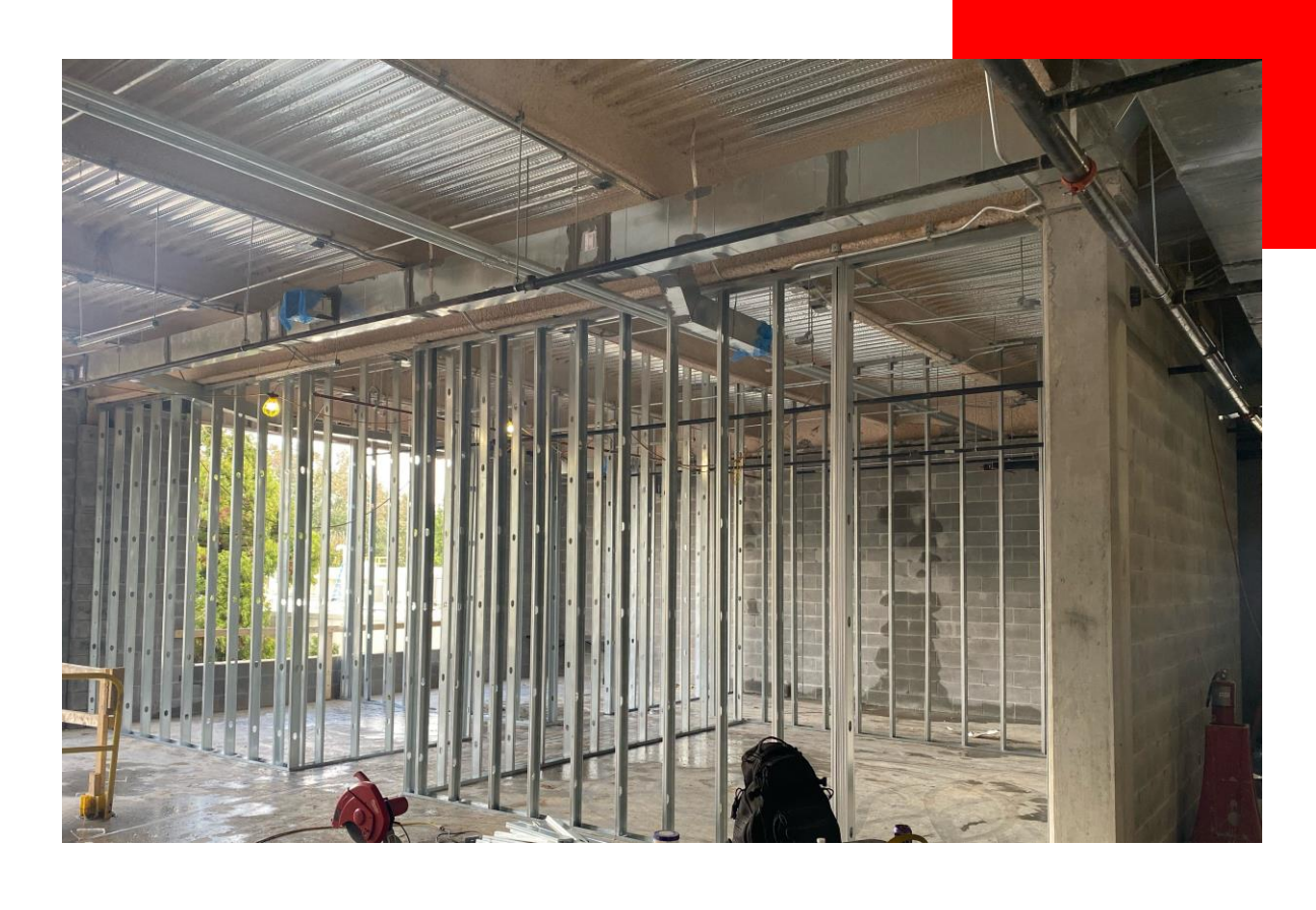
2<sup>nd</sup> Floor Interior Metal Stud Framing Progress