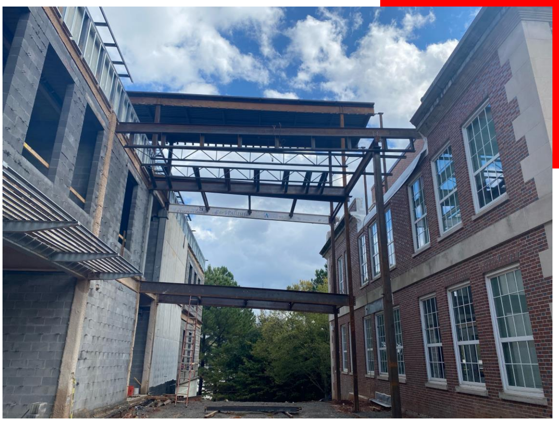
New Addition Bridge Progress